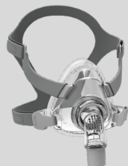
Siesta Full Face Mask