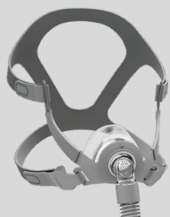
Siesta Nasal Mask